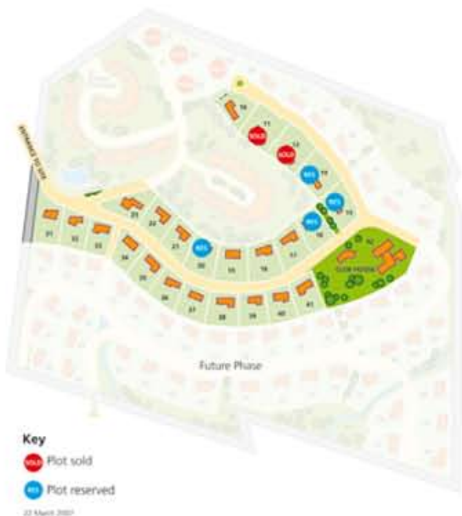
Ocean Breeze Villas Phase 1 - Site Plan

A stunning selection of 1, 2 and 3 bedroom townhouses and 3 bed villas. Rising approximately 600 feet above the sea this spectacular hillside development overlooks the panoramic scenery of Rodney Bay, Pigeon Point and Martinique. From this single point you will also be captivated by views of both the Caribbean Sea and Atlantic Ocean, and a bird's eye view of the Beausejour Cricket Stadium, one of the host venues of the World Cup Cricket 2007. Ocean Breeze is set on 3.4 acres of tropical vegetation and the 30 townhouses are built on the peak of Mount Layau. For those seeking the privacy and exclusivity of a luxury detached villa, homes at OceanBreeze offer spectacular views, peace and tranquility and a glorious tropical setting. Each detached villa is designed in a distinctive Mediterranean Andalusian style with great emphasis put on quality, elegance and finish. Plot sizes are very generous and are typically between a quarter and one third acre in size. All villas come with the option of a private swimming pool with a variety of designs and sizes to choose from. A heated spa can also be added if required.