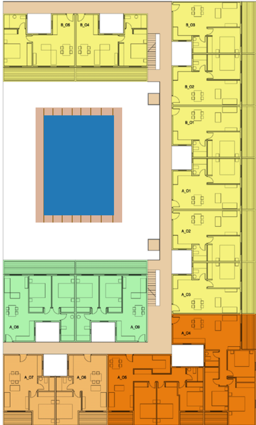
TYPICAL FLOOR - 1st, 2nd & 3rd

Example 3 Bedroom Apt: B101/301 - 1st floor B201/301 - 2nd floor B301/301 - 3rd floor